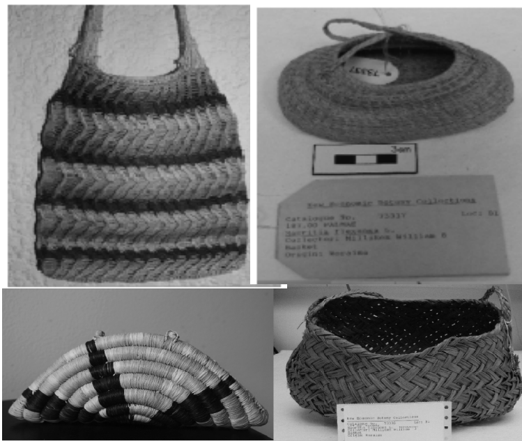
Fig. 2. Types of objects made with fibers of Astrocaryum chambira (A. Bag, B. Basket) and Mauritia flexuosa (C. Bag, D. Basket).