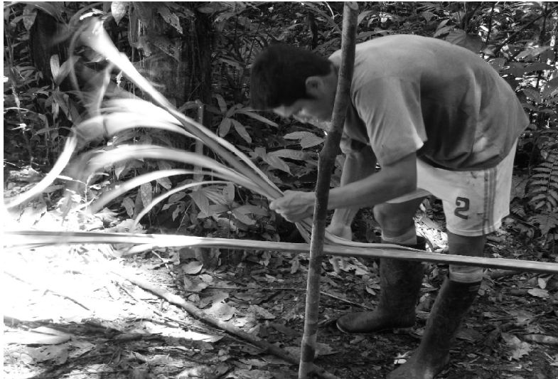
Fig. 3. Stripping leaflets of Astrocaryum chambira in the Colombian Amazon

ent and, as a consequence, traveling to the nearest market place requires much time and is expensive. Furthermore, there is market competition between products made by different social groups, as is reported for products made of chambira ( Astrocaryum chambira ) in Peru (Vormisto 2002) and mócora ( Astrocaryum standleyanum ) in Ecuador (Borgtoft Pedersen 1994). Where such competition is evident, there is great variation in prices so that, at the end, manufacturers and harvesters who can access markets tend to earn little from the commercialization of fiber and fiber objects.